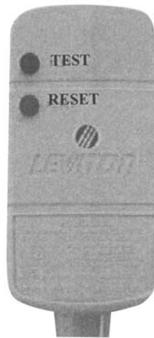
Figure 2. 120V, 15-amp GFCI Plug

All 120V spas must have a GFCI (Figure 2). This can be either a 20-amp GFCI receptacle or a GFCI cord and plug kit (CKIT110 - P/N ELE09700086).