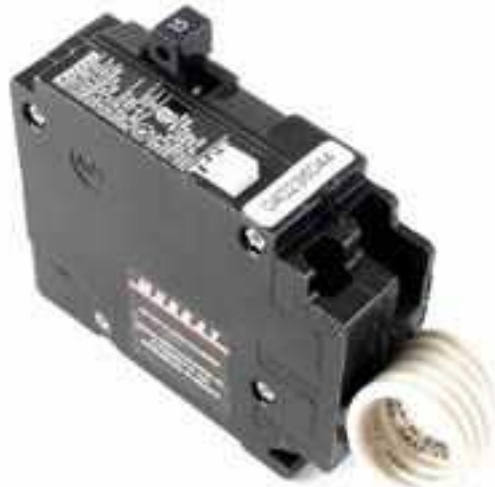
Figure 3. Sample GFCI breaker